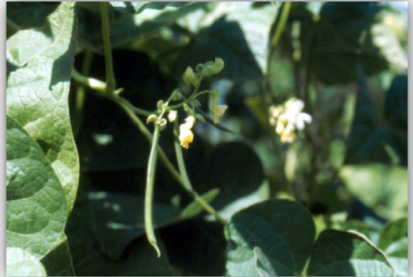
Figure 1. Beans have a high water use. With inadequate water, blossoms drop, reducing yields. When beans need water, plant color changes slightly from a dark grass green to a grayish green. Windy weather significantly increases the water demand.

Depending on temperature and wind , water use during fruiting will be ¼-inch to over ½-inch of water per day. Frequent watering in the right amount is essential for bean production.