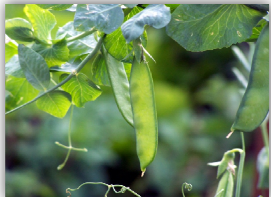
Figure 6. Snap peas are edible pod types eaten with plump peas filling the pod. Edible pod peas , sugar peas or snow peas are edible pod types eaten before the pod fills with peas.

Planting for fall harvest – Peas may be planted in mid-summer for harvest during cooler fall weather. Sweeter peas develop in cooler temperatures. However, yields of the fall crop are reduced due to photoperiodism and the vines are prone to powdery mildew in the fall.