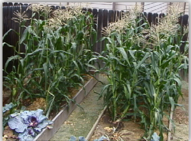
Figure 3. Corn needs to be planted in blocks for wind pollination. For pollination, two side-by-side four-foot wide beds are used. Each bed has two rows going down the bed. This makes the block four rows wide. To extend the harvest season, the top of the bed could have an early planting with a later planting at the bottom.

Pollination – Corn is wind pollinated, but bees collecting pollen also frequently visit it. When applying insecticides, use caution to protect pollinating insects. Do NOT spray tassels with insecticides.