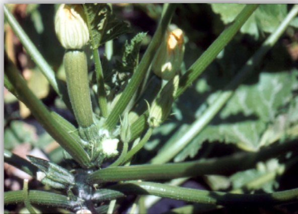
Figure 10. Vine crops have female flowers (left blossom) and male flowers (right blossoms). The female blossom has a tiny fruit at the base of the petals. For production, bees or the gardener must move the pollen from the male flower to the female flower.