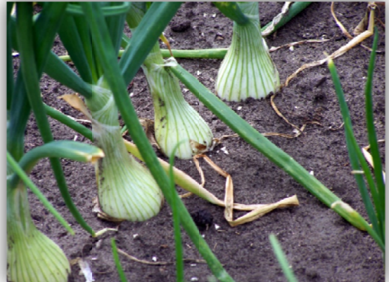
Figure 5. Onions have a shallow inefficient root system. For quality they need an even moisture supply and rich soils.

transplants. If planted from sets, sort sets larger than a dime from smaller ones. Plant small and large sets separately. Harvest from larger sets first because they do not store as well as onions grown from small sets.