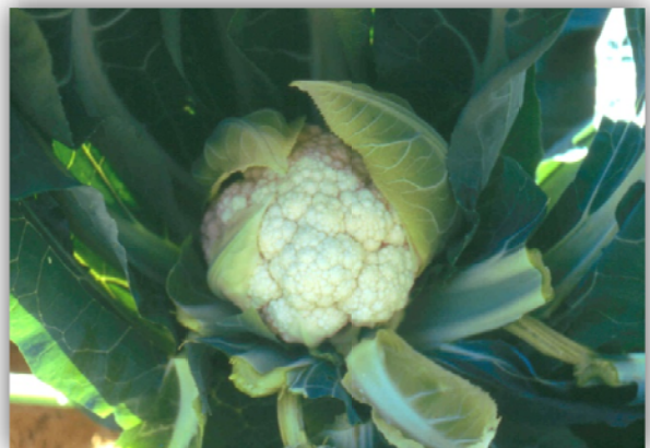
Figure 2. For quality, broccoli, cabbage, and cauliflower need cool temperatures. In warm summer climates (like the Colorado Front Range) plant mid July for harvest in the cooler temperatures of fall. They will tolerate fall frost down to the mid-20s.