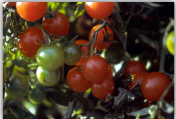
Figure 9. Sweet 100 Tomato - Over 2,000 cultivars allow the gardener lots of options in flavor, fruit size, and disease management.

Blossom end rot – Irregular watering and over-watering causes development of a dark, leathery area on the blossom end of fruits. Water consistently in a deep, improved garden soil and mulch will help prevent this condition.