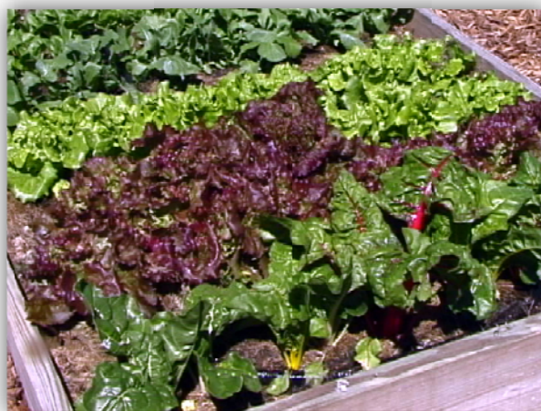
Figure 4. For quality, leafy vegetables need a constant supply of water, rich soils. For best quality, thin plants when crop is tiny. Here a variety of leaf vegetables are in a raised bed, going across the box. As one row is harvested, immediately replant for a continual harvest of young tasty produce.

Planting for fall harvest – Plant lettuce and spinach in mid to late summer to produce exceptional harvest quality during cool fall weather. It can also be planted mid-fall for extra-early spring crops. Cover the small seedlings with organic mulch for winter protection.