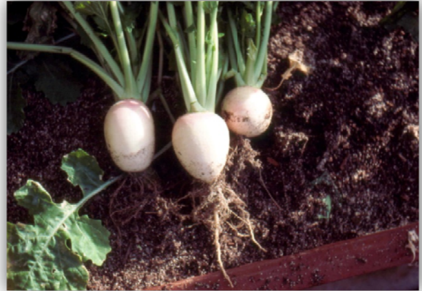
Figure 8. Burpee white radish: for quality, root crops need an even moisture supply and rich soil.